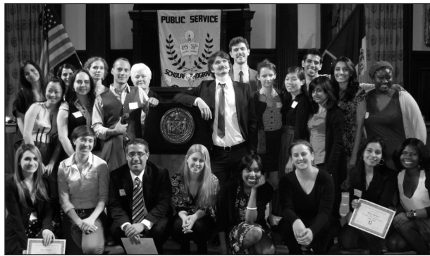
2010 Public Service Scholars

F riends, family members, significant others, supervisors, alumni, mentors and city representatives gathered on May 10th in the New York City Hall Council Chambers to commend the 2010 Public Service Scholars for their fellowship year in public service. Twenty-three scholars leave the Public Service Scholar Program focused on a meaningful career path and empowered to make a difference.