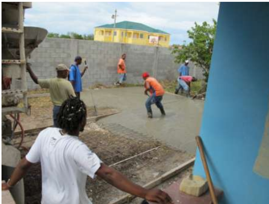
Figure 14. Barbuda Council crews pour cement slab around the Research Station Main Building. The concrete was donated by a local contractor and the labor was provided by the Barbuda Council and the High School Manual Arts class. The concrete surface will be covered with shade structures to provide outdoor classroom and wet lab working space.