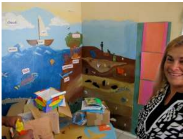
Figure 12. Heavily used 2010 renovated science reading classroom Barbuda Elementary School