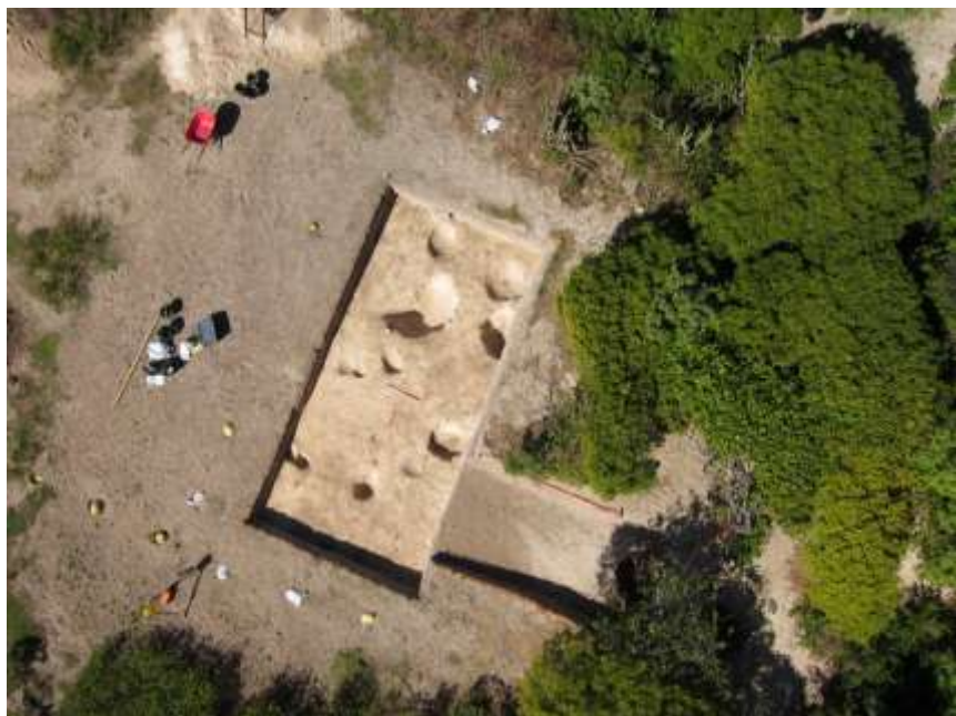
Figure 8. Kite aerial photo of the Seaview early Saladoid Ceramic Age site showing patterns of pits and hearth features associated with nearly intact village site under open area excavation by CUNY team led by CUNY Anthropology ABD Aaron Kendall.