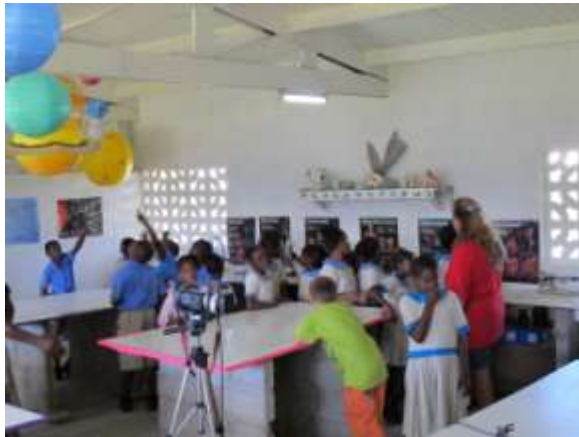
Figure 11. Renovated classroom equipped with lab project kits tied to the existing science curriculum.