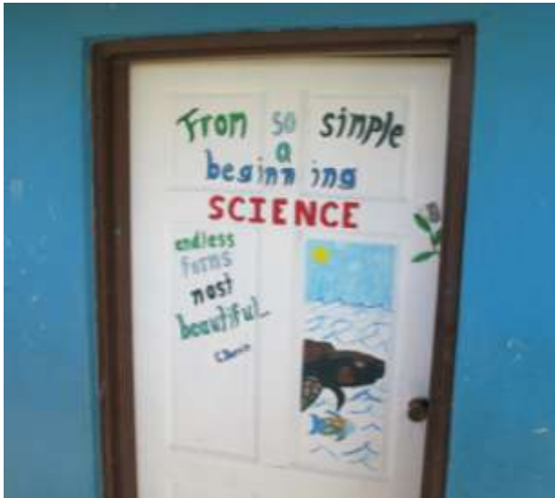
Figure 10. Door of renovated science classroom, Barbuda Elementary School