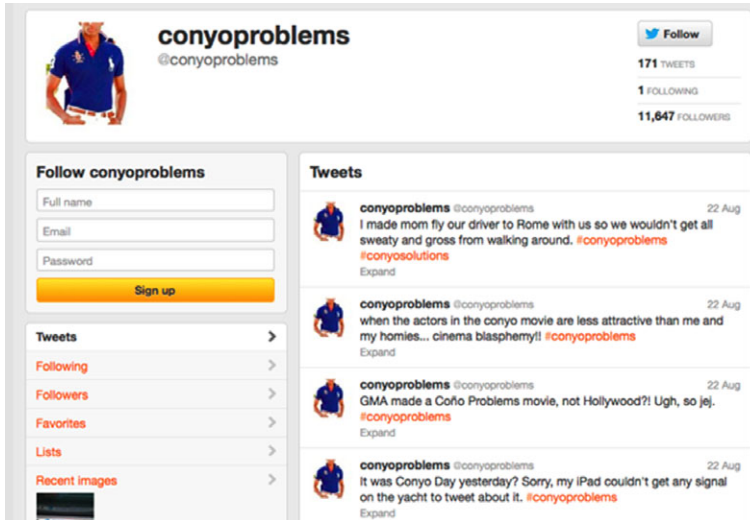
Figure 2. @conyoproblems [This figure appears in color in the online issue.]

Commentary on conyo language, people, and lifestyle is often generated by urban, elite private school-educated youth in or from the Philippines. In my ethnographic research at an elite private university in Manila, I found that the private school is often framed as either the “natural habitat” of conyo or the site for its duplication: where Filipinos are conyo, where Filipinos become conyo. Conyo is typically an epithet for others, not a label that is claimed for oneself. Thus at the private school, conyo is always near but also always “over there.” Indeed, conyo functions as a problematic youth category since it is tied to how the elite are educated in the private school to be the “wrong” kind of Filipino: materialistic, arrogant, and foolish. Conyo is often set in relation to other social figures: in contrast to jolog or jejemon (or jej [see figure 2]) (tacky urban masses) and in similarity to sosyal (high-class) and colegiala (Catholic school girl). Even though conyo can be a label applied to any gender, it often signals feminized affect: for example, using expressive language (excerpt 1), being overly concerned with one’s appearance (figures 1–2), or having a refined palate (figure 3). Thus males who are labeled conyo are sometimes viewed as “effeminate.”