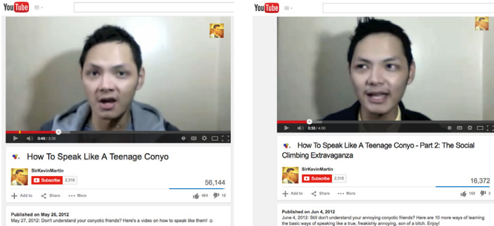
Figure 6. How to Speak Like a Teenage Conyo [This figure appears in color in the online issue.]