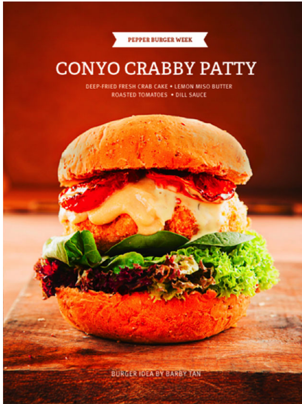
Figure 3. Conyo Crabby Patty [This figure appears in color in the online issue.]