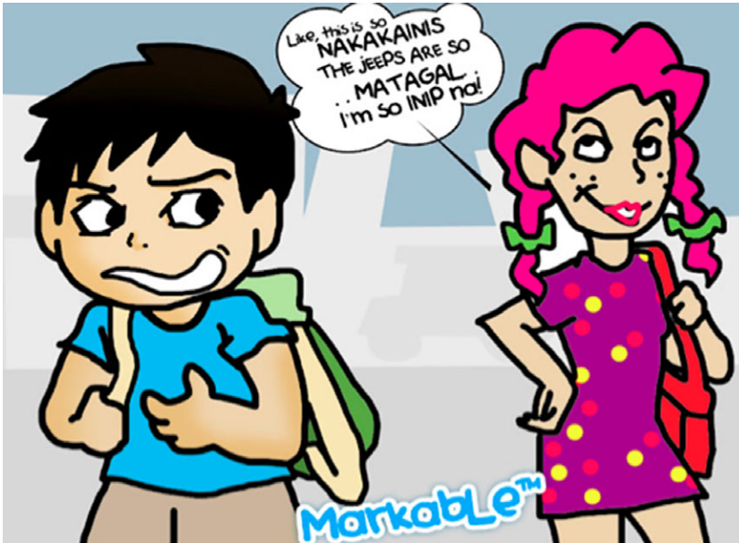
Figure 4. Listening Subject of Conyo [This figure appears in color in the online issue.]

Figure 4 is an example of the conyo figure emerging in contrast to its listening subject. This is a cartoon that appeared alongside the 2012 blog entry entitled, “Are conyo people funny, creative or just annoying?,” written by a college student. 5 On the right is the speaking subject. She represents the subject of this post, that is, “conyo.” She is youthful; she has braids, freckles, and wears a short dress. One of her hands is on her hip, the other holds her purse—an almost identical pose found in the “How to Be a Conyo” video above (figure 1). Her eyes are rolling, as she complains about waiting: “Like, this is so nakakainis (annoying). The jeeps are so matagal (slow). I’m so inip (bored) na (already)!” On the left is the listening subject. He is youthful too; he wears a backpack. He is looking at her. He is listening to her. He is cringing.