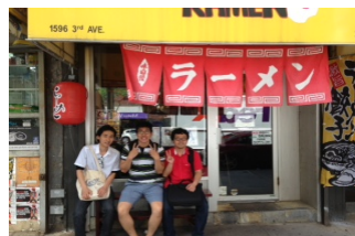
In front of the restaurant

When we arrived there, although it was 3PM, we had to wait 5minutes to enter the restaurant.