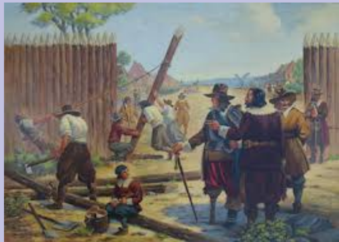
The original Wall Street

the name of the Hudson river comes from his name. The name "Manahatta" is originally an Indian word. Also, Wall Street once was really a wall be-