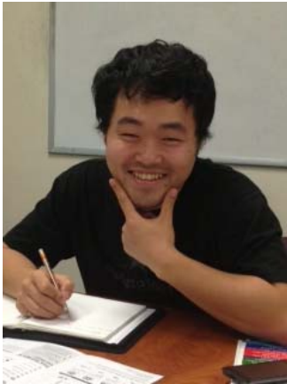
Reporter: GeunSeo Song

I think students need to use library, however many IELI students don't know about Hunter College Li-