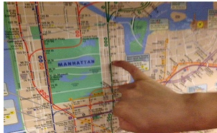
This shows the location of Naruto Ramen

When we start to write about ramen, we think we need practical experiences. Then, Fiore suggested that we go to Naruto ramen. The restaurant is located on the Upper East Side, so the restaurant is in a silent and kind neighborhood. It is good for tasting. When we were on the way to the restaurant, we are very excited like people who are going to picnic. It was pretty hot, but it couldn't stop us. The restaurant is near by Hunter College. We just took a train about 4minutes and walked about 5minutes.