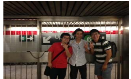
We were excited to go to new place

When we arrived there, although it was 3PM, we had to wait 5minutes to enter the restaurant.