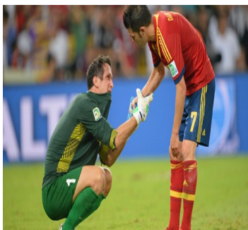
Spain striker David villa is encouraging Tahiti team's goalie.

days ,but Tahiti is not a professional team. Most Tahiti players have two jobs. They are truck drivers, mail delivers, tour guides something like that. Only one person is a professional player, but they play very hard and try to win what they can against in soccer match.