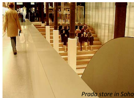
Prada store in Soho