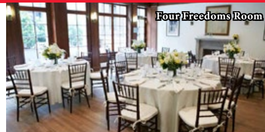
Four Freedoms Room

For events large or small, corporate or private, our campuses are outfitted with small meeting rooms to an expansive auditorium with spaces ranging in capacity from 15 to 2040.