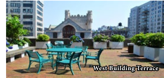
West Building Terrace