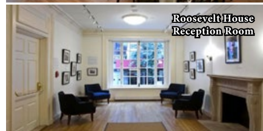
Roosevelt House Reception Room

The Auditorium's state of the art technology makes it ideal for conferences and film screenings.