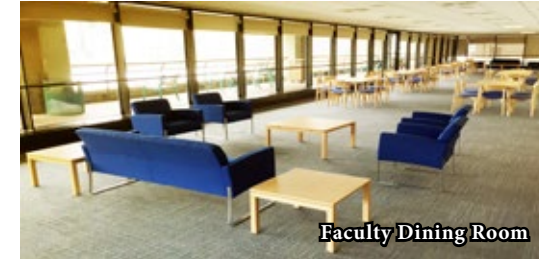
Faculty Dining Room