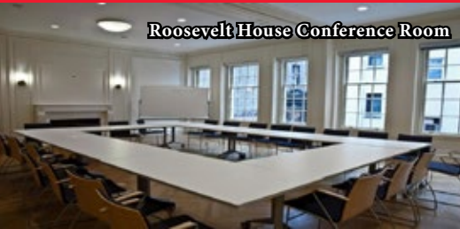
Roosevelt House Conference Room